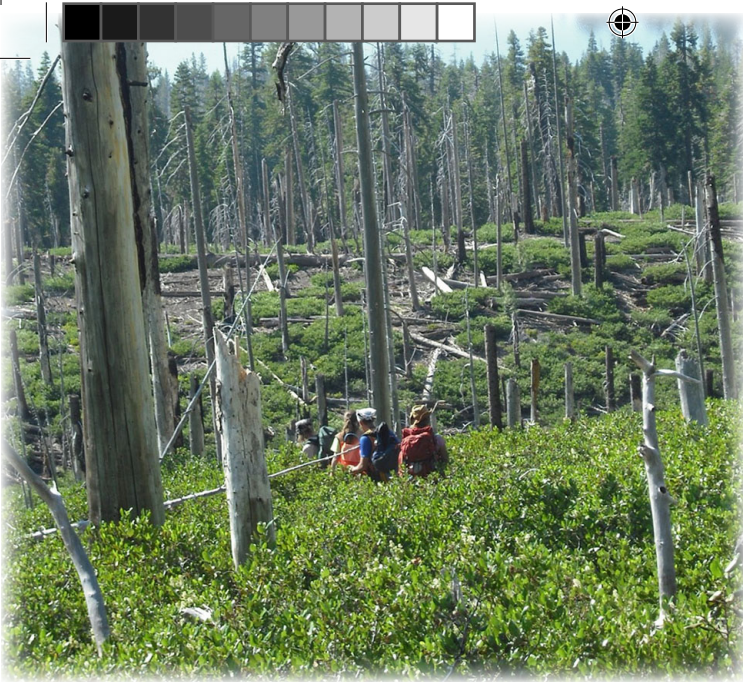
Shrubs take over a former forest area that burned 18 years ago.