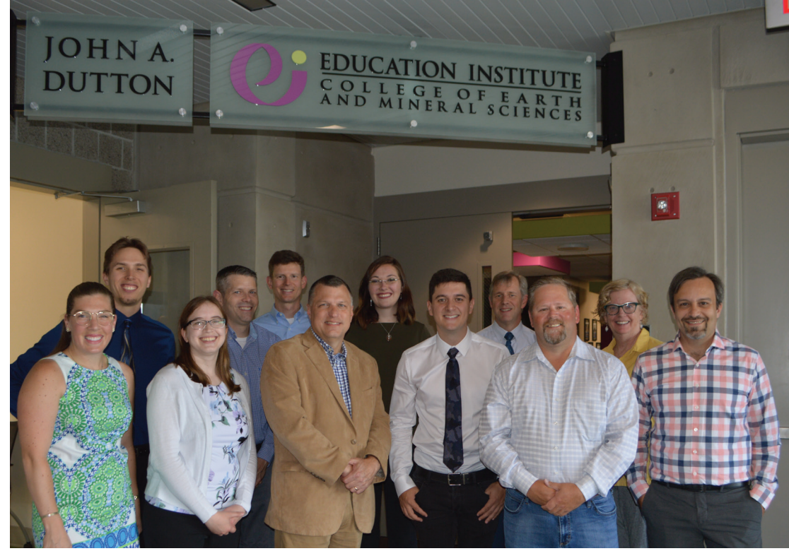
Online geospatial education program students and faculty gather for a reception prior to summer 2019 commencement.

within the Master of Professional Studies in Homeland Security. More than 4,000 students have completed a certificate or degree from the Online Geospatial Education program. The program has also earned Esri's Special Achievement in GIS Award (2004) and the Sloan-C (now Online Learning) Consortium's award for Most Outstanding Online Program (2009).