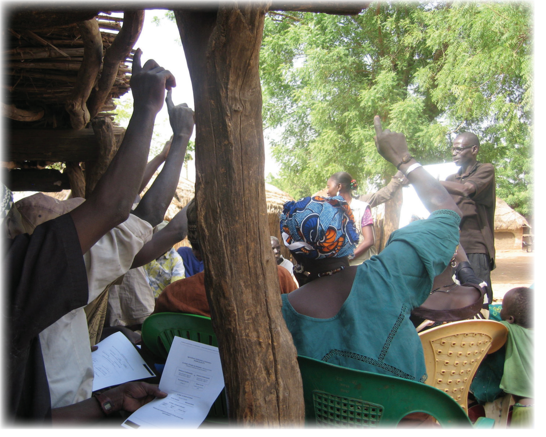
Villagers meet to design custom rainfall insurance within the World Food Programme's R4 Rural Resilience Initiative. Kouthiakoto Ndene village, Senegal 2013.